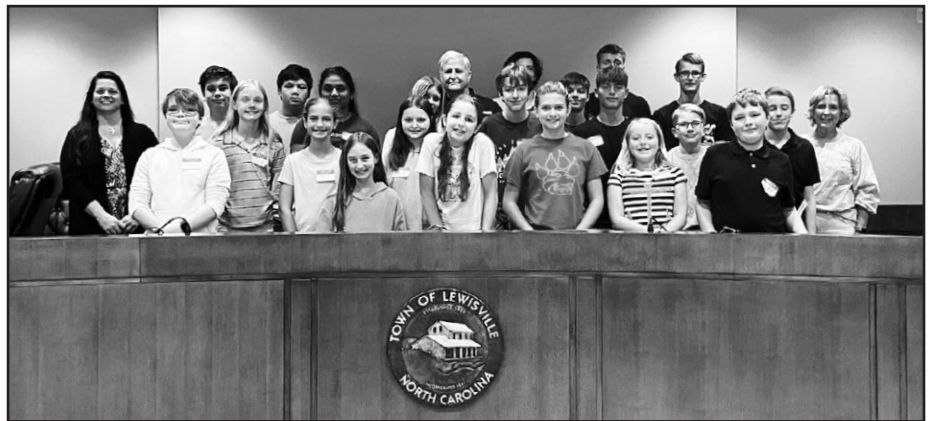
Summer Student Leadership – Class of 2022

SATURDAY, AUGUST 19 Shallowford Square See page 5 for details