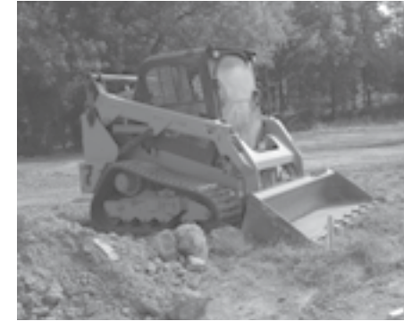
Construction Continues at Jack Warren Park

Work should be wrapping up soon on the new Jack Warren Park expansion and hopefully everyone is as excited as we are for the new opportunities. A nature trail winds through the wooded areas and will provide a relaxing and eventually informative stroll for nature lovers. An 18-hole “Ace Place” disc golf course threads through open and wooded sections, and offers a unique and exciting chal-