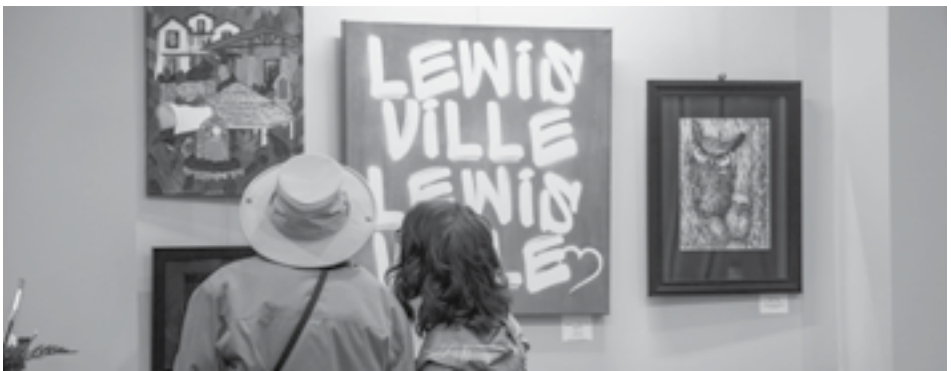
Visitors admire artwork at the 2024 winter art show