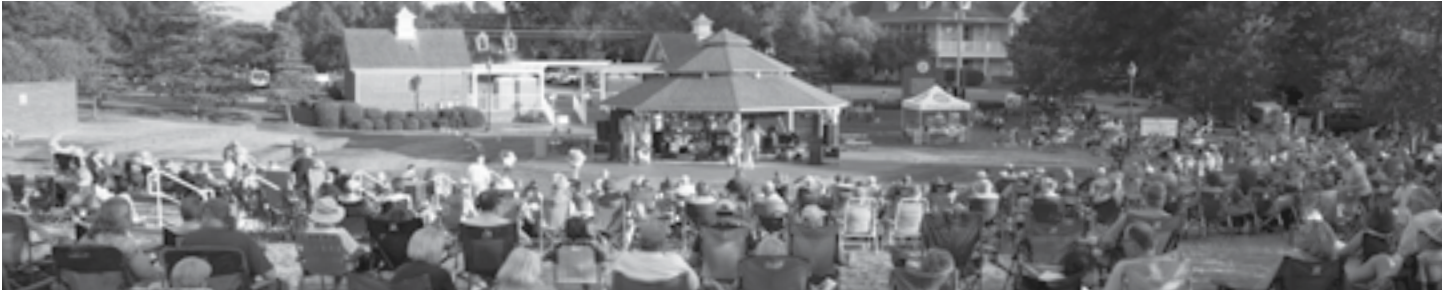
Independence Day Concert 2024

6510 Shallowford Road, P.O. Box 547, Lewisville, NC 27023-0547 Ph. 336-945-5558