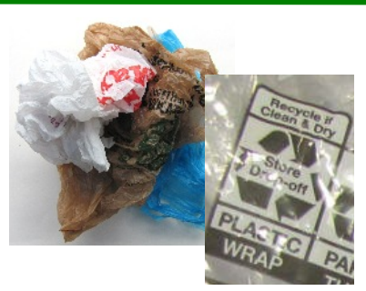
Plastic Bags & any plastic wrap labeled as "store drop-off". These can also be taken anytime to bins at local grocery stores.