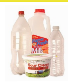
Plastic Bottles, Tubs, & Jugs Small-necked #1s & 2s, #5 tubs. Rinse clean, labels, lids, and caps okay.