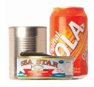
Steel & Aluminum food and beverage cans, foil, & pie tins. Rinse clean, labels okay.