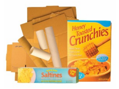
Clean Cardboard, chipboard/paperboard. Remove foil or plastic liners, break down boxes.