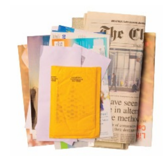
Paper Newspapers, junk mail, office paper, magazines, phone books, paper bags. Shredded paper should be bagged in clear plastic.

For more information on Lewisville's Curbside Recycling go to: https://lewisvillenc.net/public-works/solid-waste-recycling