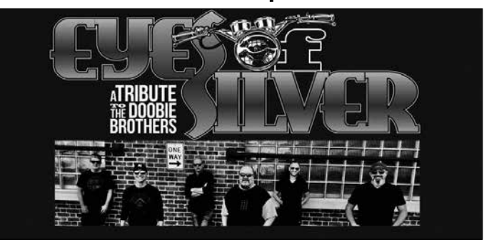
Admission is free! Delicious eats will be available for purchase. No pets permitted. Bring a lawn chair and enjoy a night of music under the stars at Shallowford Square.

"Eyes of Silver" Doobie Brothers Tribute Band will impress you with their spot on musical performance, harmonies and stellar vocals. Prepare to be transported back to the 1970s music scene. This is a must see concert!