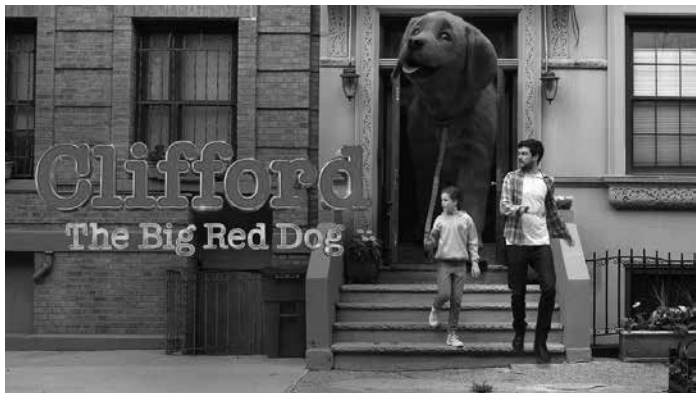
enjoy this special October film in the Square. Reminder, no pets allowed in the Square.

Admission is free. Bring a lawn chair or a blanket and