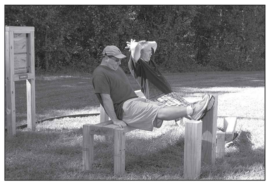
The Par Course at Jack Warren Park has since been completed, but even before it was finished, it was being used.

"The Great Wagon Road is on the Metropolitan Planning Organization's projects list with an ac-