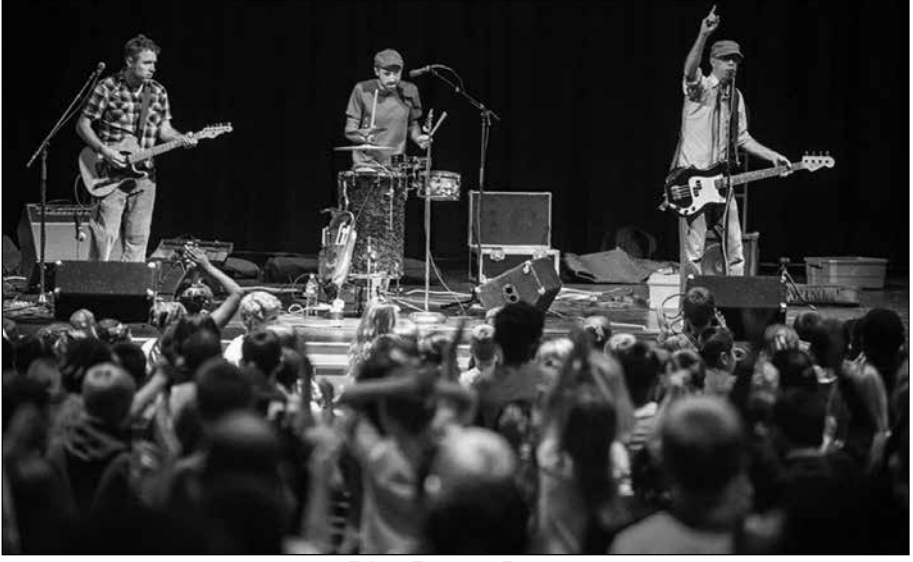
Big, Bang, Boom

Admission is free! Bring a lawn chair and enjoy a family-friendly concert at the Square.