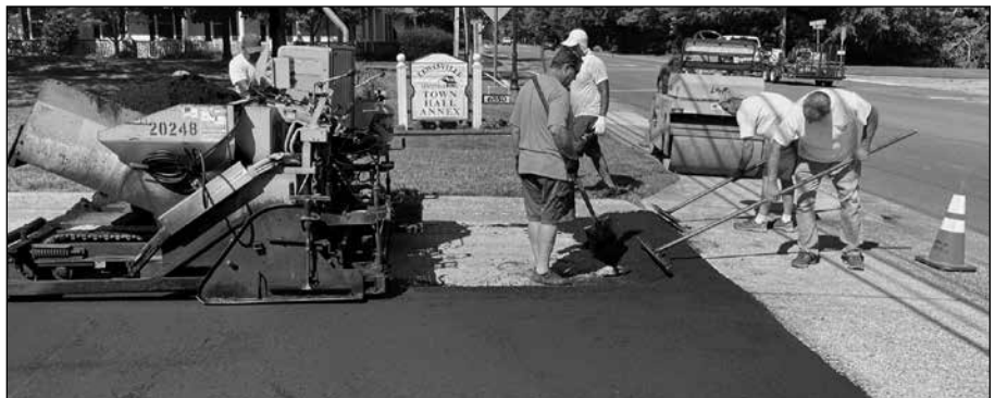
The Town Hall Annex parking lot recently received a facelift with a repaving.