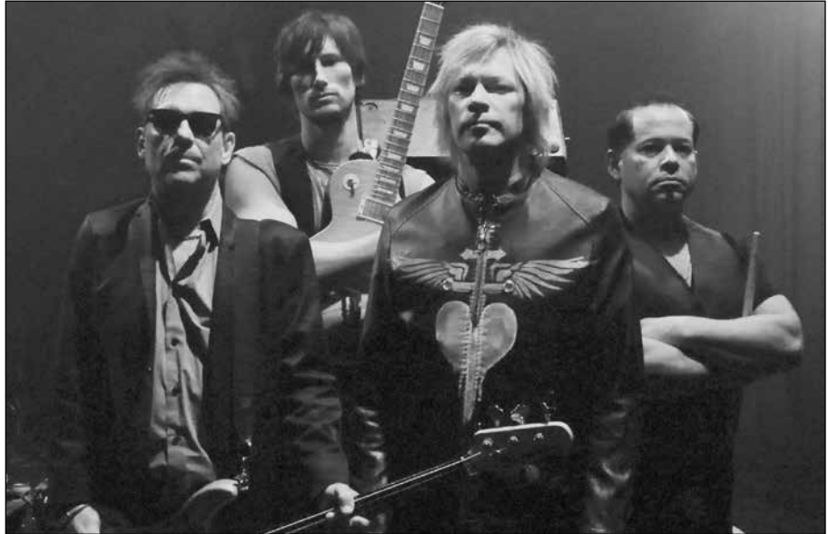
SLIPPERY WHEN WET

Admission is free! Bring a lawn chair or a blanket. Concessions are available for purchase. No pets please.