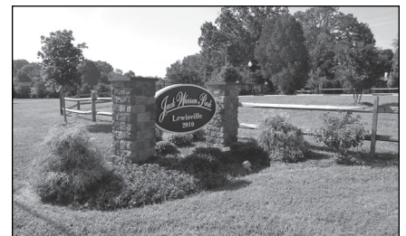
TOP: Great Wagon Road/Roller Mill BOTTOM: Jack Warren Park

visioning and public outreach, comprehensive plan update, See PLANS, Page 5