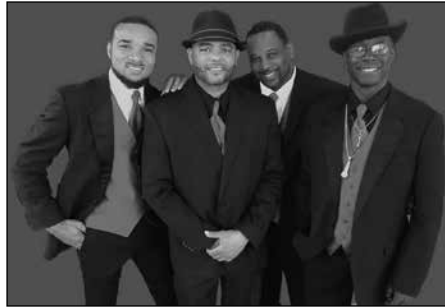
Legacy Motown Revue Band one of the most influential periods in American Musical History.

Featuring incredibly talented singers that dance and sing, plus an amazing six piece horn band. You will be transported back in time to