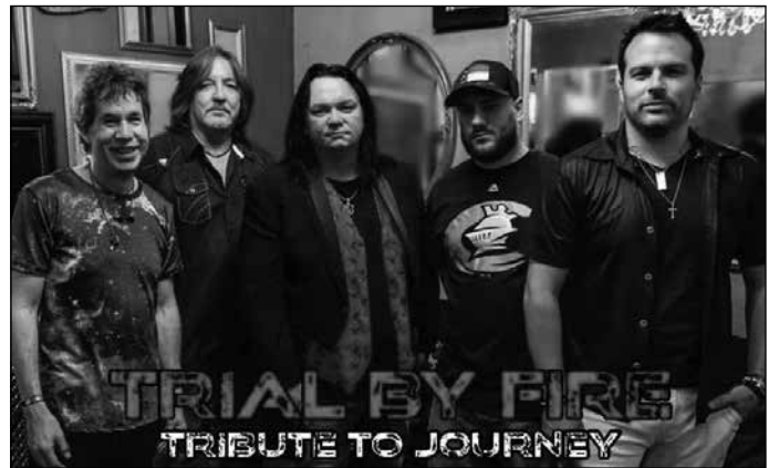
pandemic and precautions. Please visit the Town's Facebook page and website for updates.

*This event is subject to change due to COVID-19