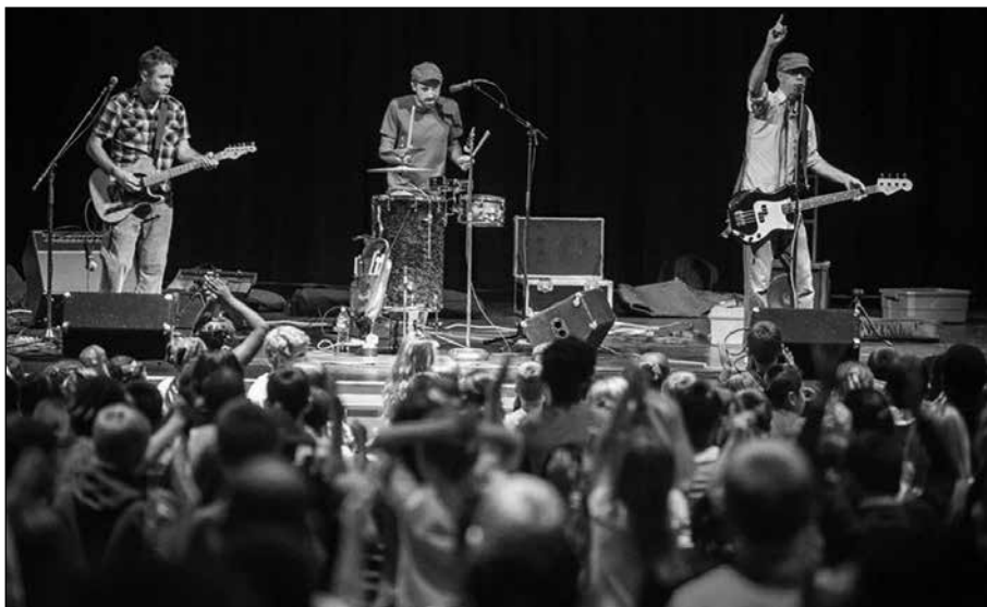
Big, Bang, Boom

Admission is free! Bring a lawn chair and enjoy a family-friendly concert at the Square.