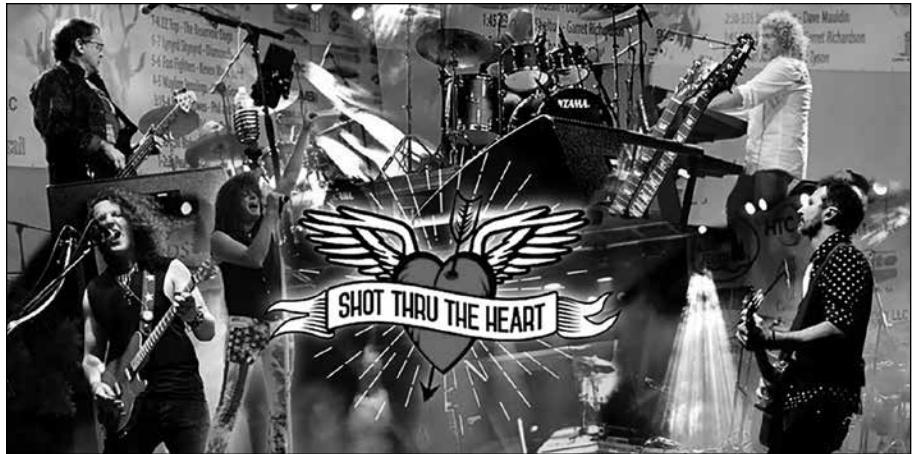
'SHOT THRU THE HEART'

Each member of Shot Thru the Heart is a seasoned, professional musician and entertainer. The energy emitted from the stage is contagious and reminiscent of the great arena