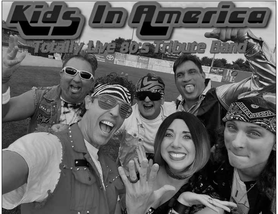
KIDS IN AMERICA

Kids in America is a high-energy, power-packed, ultra fun, six-piece band paying tribute to the totally awesome 1980s. They cover all genres from this timeless decade including new wave, pop, dance and rock, rock ballads and more. Kids in America specializes in recreating visually and take pride in delivering spot on sound of all your favorite 80s hits. This show covers the biggest hits and artists of this iconic era! Madonna, Michael Jackson, Guns and Roses, Duran Duran, Prince, Journey, Cyndi Lauper, The Cure, Pat Benatar, The Cars and much more! Costumes, props and performance provide a full 80s stage show. Kids in America Band brings any event to the next level.