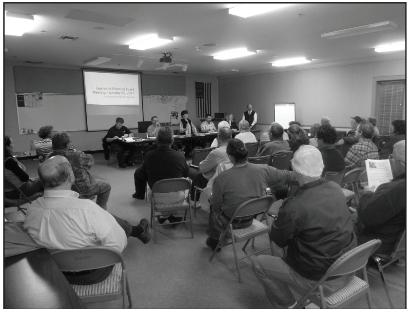
Members of the Lewisville Planning Board met with residents to discuss the Northeast Area Plan draft.

Planning board meets with residents to discuss future growth in northeast Lewisville, new school site