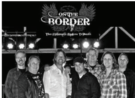
On the Border - The Ultimate Eagles Tribute Band!

Bring a lawn chair and settle in for an amazing concert under the stars.