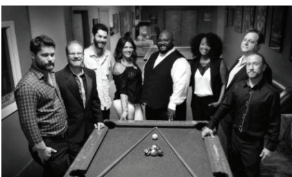
The Straightfire Band