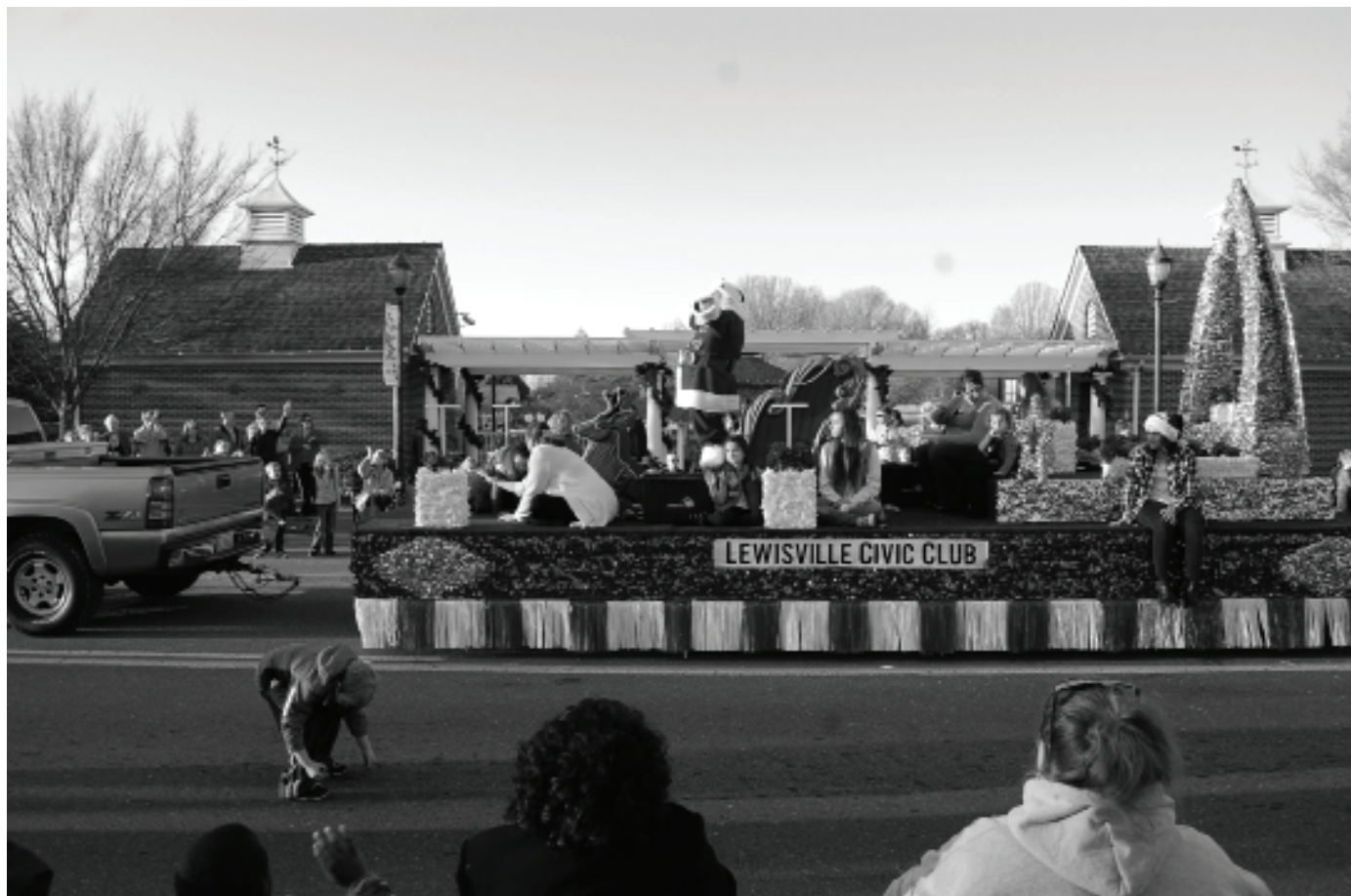
2014 Lewisville Civic Club parade float featuring Santa Claus.

The parade starts at 3 p.m. and normally takes more than an hour, so please plan accordingly.