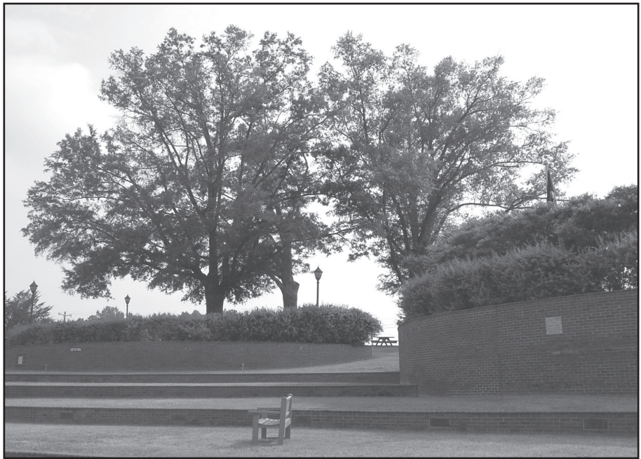
This photo was taken just before the tree on the left was taken down several years ago.

A large limb fell recently and the tree experts called back in had only bad news. The dying trees are dying