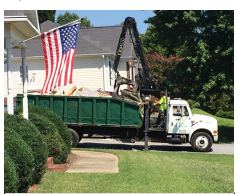
Waste Management uses a special truck fitted with an arm to pick up and transport bulky items

The next Bulky Item Pick-Up event is scheduled to begin Monday September 25. Those residents wishing to participate in the pick-up should have all acceptable bulky items curbside by 6 a.m.