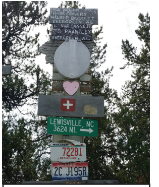
Sign post photo courtesy of Richard Ernest

There are currently over 80,000 signs placed by travelers on the highway, from all over the world including the Lewisville, NC directional sign.