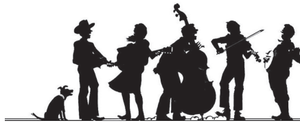
Mill Road, ShadowGrass, The Trailblazers, Carolina Pinecones, Grassifieds and The Snyder Family

The Bluegrass Festival will feature talented bands including Cane