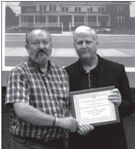
Stilphen Honored for Service

For more information visit https://tinyurl.com/yav4v8e9 .