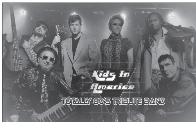
KIDS IN AMERICA

concessions are available for purchase. Bring a lawn